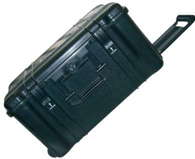
Heavy duty transport case

Heavy duty transport case in black plastics, with wheels, cover and handle.