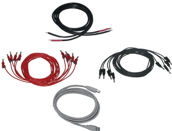
T 1000 PLUS - Standard cable kit

The kit includes cables for any kind of connection.