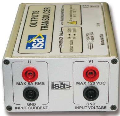
Output transducer module

The items can be ordered separately: the Output transducer alone, or also one cable or both.