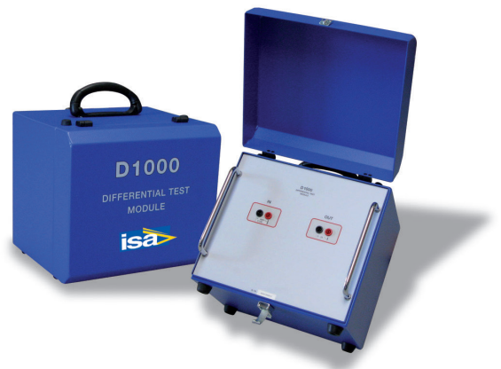
D 1000 Differential relay test module